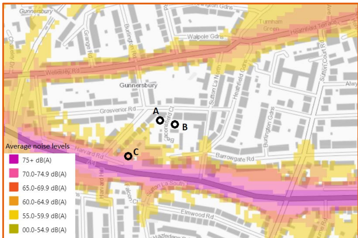
Figure 2: Defra LAeq 16-hour daytime road noise contour. Site 20 indicated by black markers.

During the daytime, road traffic noise has potential to impact on internal noise levels as well as the amenity of garden areas. Residential development could be considered acceptable but further noise assessment would be required.