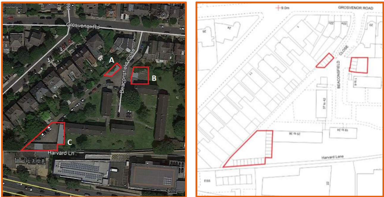
Figure 1: Site Location Plans

The site location is shown in Figure 1 below.