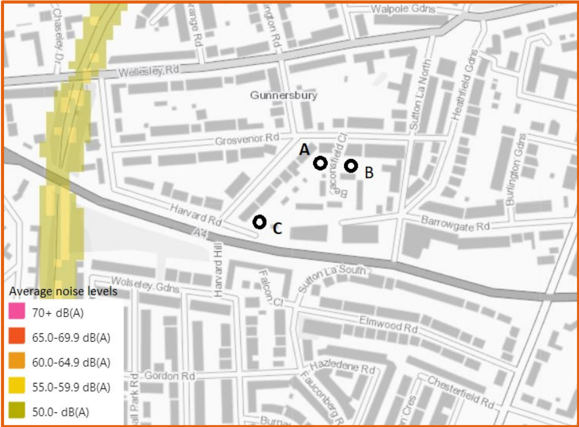
Figure 5: Defra Night rail noise contour. Site 20 indicated by black markers.